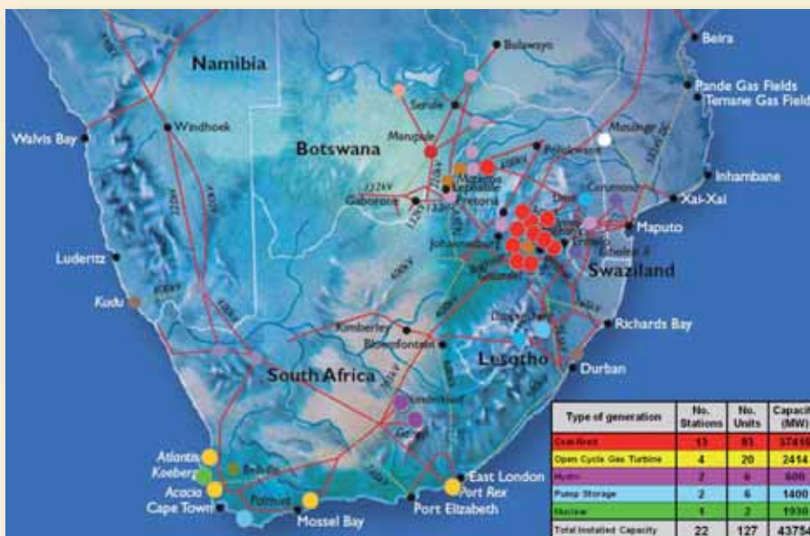
Figure 1: Eskom's "shop floor". Each of the coal-fired units typically consists of a boiler and a 600MW generator - although this can vary.