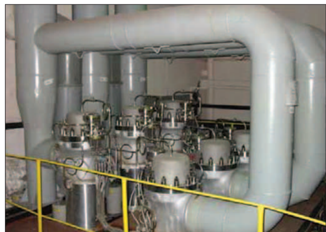
Fragment of Kola NPP equipment

Some parameters are transferred to archive server by means of input-output server of OPC Link. Others are collected through MDAS from linked SQL servers by means of implementation by SQL the inquiries to Events tag. Current time in lower level systems and OCD is strictly synchronized with upper level systems' time. In