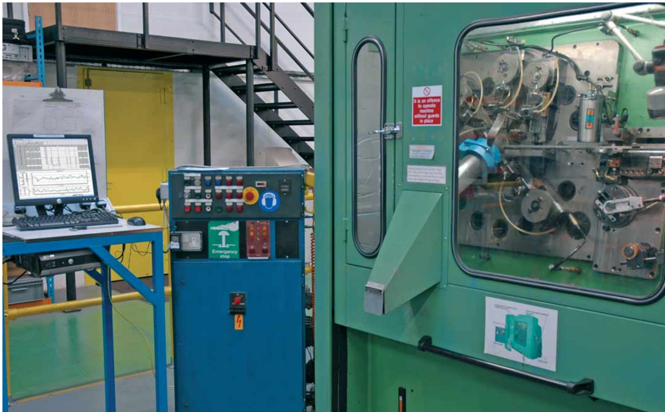
Ring production with quality control workstation

communication interfaces is now being evaluated and will be integrated to QIA as the business case is developed. This will allow faster quality procedures with further reduced risk of error.