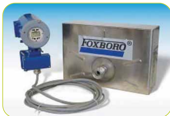
Foxboro CFT50 digital Coriolis flowmeter.

Figure 1 shows that prior to the onset of flow, both meters had a zero reading, while the density reading indicated that the meters were 'wet and empty.'